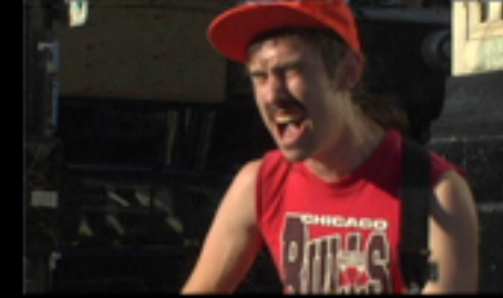
Save the Hipsters

Almost half of the world's wild hipster species are at risk of extinction. We journey to one of the last natural havens to document their daily struggle to live, in spite of the vinyl shortage and the encroaching yuppie species.