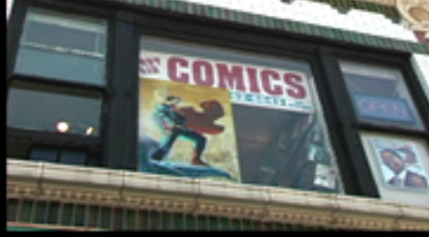
Latest Issue: Comic Books and the Movies

For the last 75 years, comic books have enjoyed their counter-culture status. However, with the recent big-budget superhero and comic book movies, comics are transitioning into the mainstream. This documentary looks at this transition period in comics and how its effecting the readership and industry as a whole.