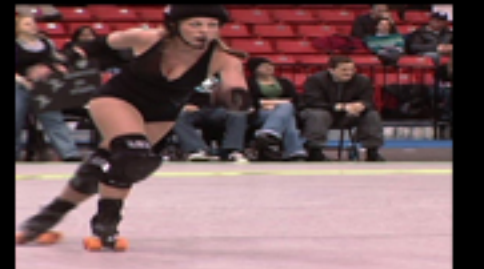
Windy City Rollers