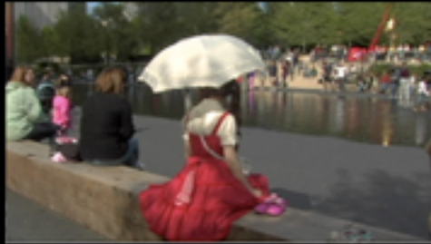
Lolita In Translation

While the immediate connotation of "Lolita" is Nabokov's masterpiece, this documentary provides an intimate glimpse into the world of a different Lolita. Explore the Chicago community from the perspective of four collegiate Lolitas as they examine the origins, peculiarities, and meanings of their subculture.